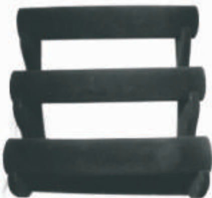
TT - 9697 (HEIGHT - 11") FULLY FOLDING BANGLE STAND (VELVET)