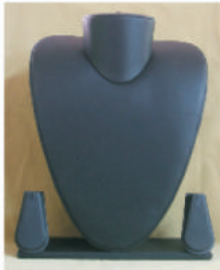
TT - 9469 (HEIGHT - 13") (AVAILABLE IN BALAK OR WHITE) N/STAND (PVC)