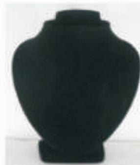
TT - 9284 (HEIGHT - 9") N/STAND (VELVET)