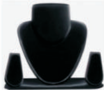
TT - 5623 (MEDIUM) (HEIGHT - 7") N/STAND (VELVET)