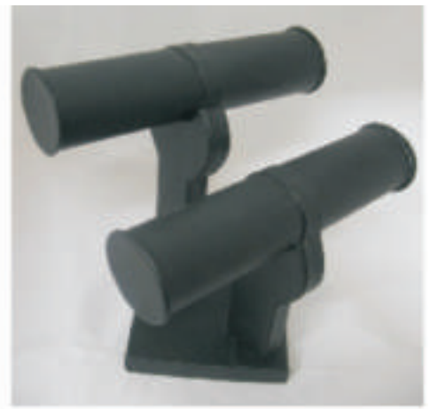
TT - 9472 (HEIGHT - 9") (AVAILABLE IN BLACK OR WHITE) 2 - STEP FIXED BANGLE STAND (PVC)