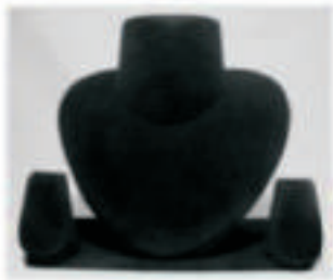
TT - 5622 (MINI) (HEIGHT - 5.75") N/STAND (VELVET)