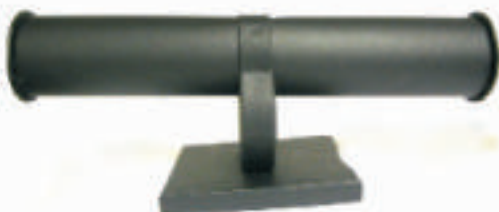
TT - 9334 (HEIGHT - 4.5") (AVAILABLE IN BLACK OR WHITE) FIXED BANGLE STAND (PVC)