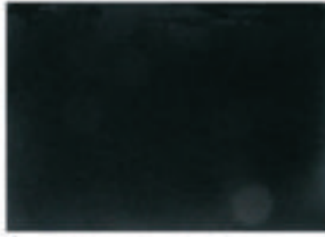
VELVET DISPLY BOARD TT - 8999 - (12"X8.25")