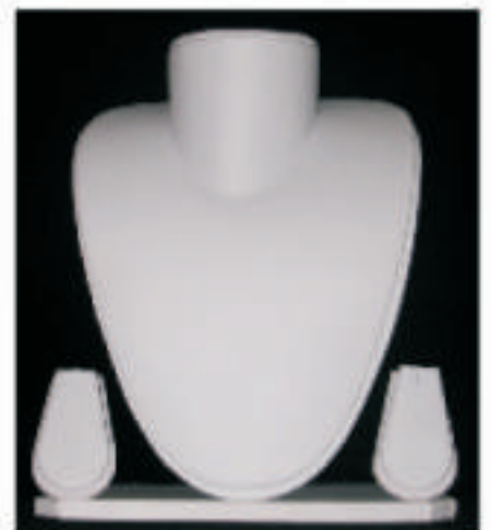
TT - 9468 (HEIGHT - 10") (AVAILABLE IN BALAK OR WHITE) N/STAND (PVC)

All above prices are in sterling pound and subject to VAT carriage