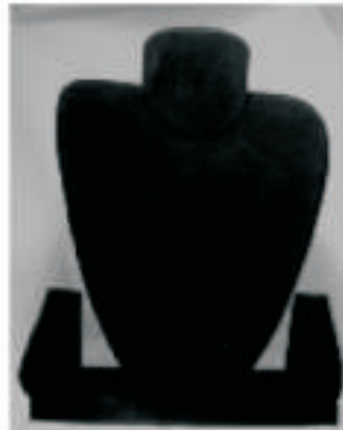
TT - 5558 (LARGE) (HEIGHT - 10") N/STAND (VELVET)