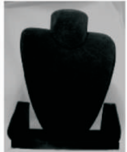
TT - 5559 (JUMBO) (HEIGHT - 12.5") N/STAND (VELVET)