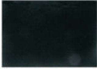
VELVET DISPLY BOARD TT - 8998 - (10.25"X7.5")