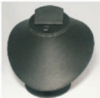
TT - 9336 (HEIGHT - 6.5") (AVAILABLE IN BLACK OR WHITE) SLANT N/STAND (PVC)