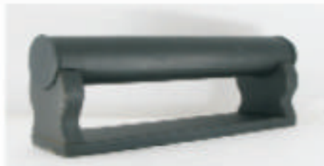
TT - 9542 (HEIGHT - 5") (AVAILABLE IN BLACK OR WHITE) FOLDING BANGLE STAND (PVC)