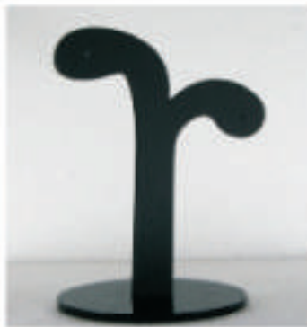
SH - 9404 ACRYLIC E/R STAND