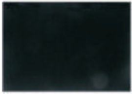
VELVET DISPLY BOARD TT - 9227 - (6"X7.5")