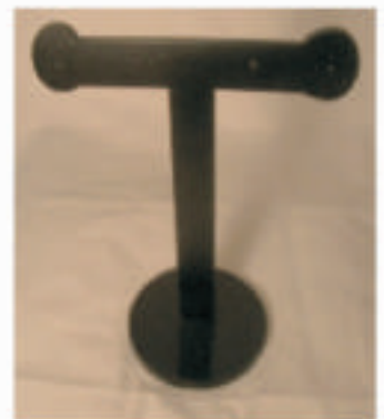
SH - 9405 ACRYLIC E/R STAND