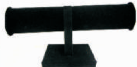
TT - 8997 (HEIGHT - 4.5") FIXED BANGLE STAND (VELVET)