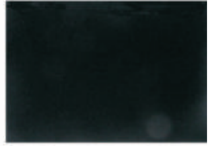
VELVET DISPLY BOARD TT - 9000 - (11.25"X14")