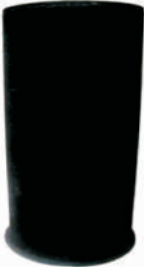
TT - 9289 (HEIGHT - 12.5") TIARA STAND (VELVET)