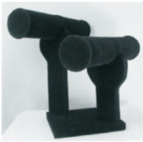
TT - 9457 (HEIGHT - 9") 2 - STEP FIXED BANGLE STAND (VELVET)