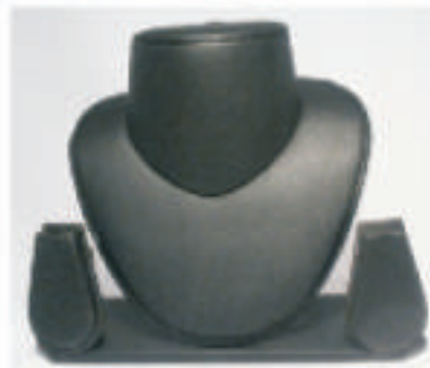
TT - 9317 (HEIGHT - 7") (AVAILABLE IN BLACK OR WHITE) N/STAND (PVC)