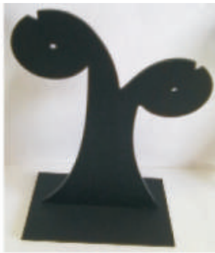
ACRYLIC E/R STAND (FOLDING) SH - 9979 (HEIGHT - 5.25") SH - 9980 (HEIGHT - 6.25") (AVAILABLE IN BLACK OR CLEAR)