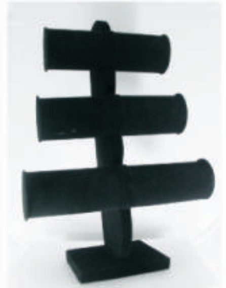
TT - 9410 (HEIGHT - 13.5") FIXED BANGLE STAND (VELVET)