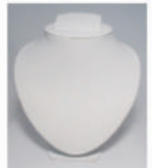
TT - 9671 (HEIGHT - 8.5") (AVAILABLE IN BLACK OR WHITE) N/STAND (PVC)