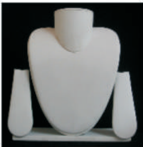
TT - 9826 (HEIGHT - 10, E/R HIGHT - 5") (AVAILABLE IN BALAK OR WHITE) N/STAND (PVC)